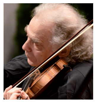
Zakhar Bron <sup>Violin</sup>